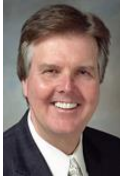
Lt. Gov. Dan Patrick (R – Houston)

General Election Opponent: Lupe Valdez (D – Dallas)