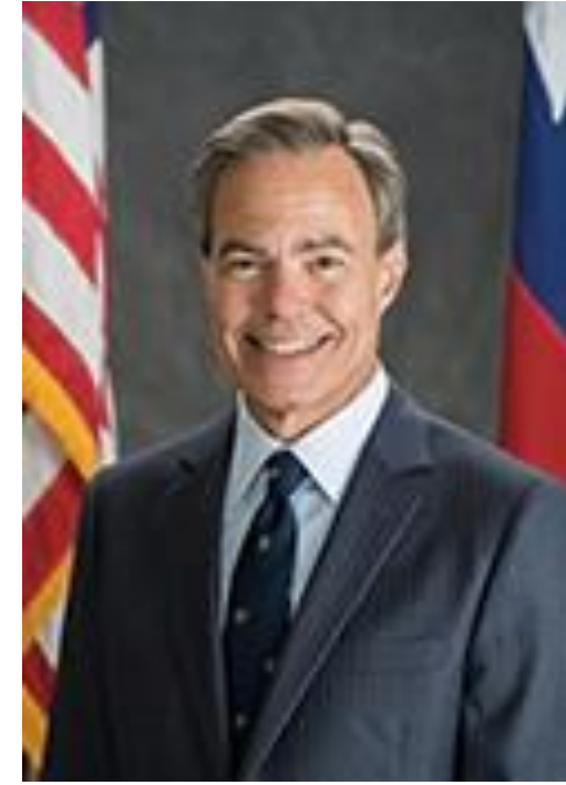
Speaker Joe Straus (R – San Antonio)