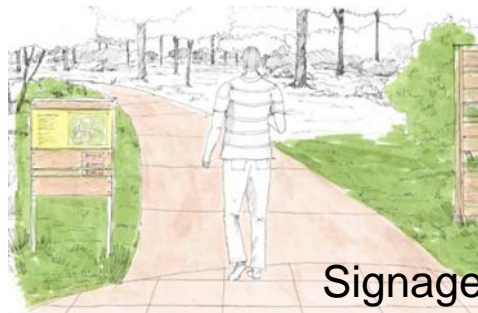
Signage & Wayfinding