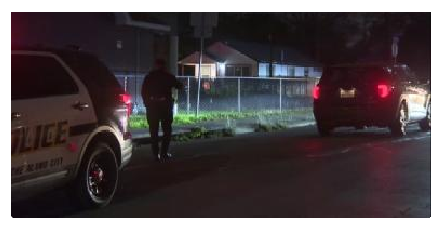
Teen killed in botched drug deal identified by medical examiner's office