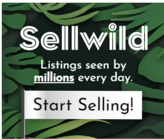
Powered by Sellwild