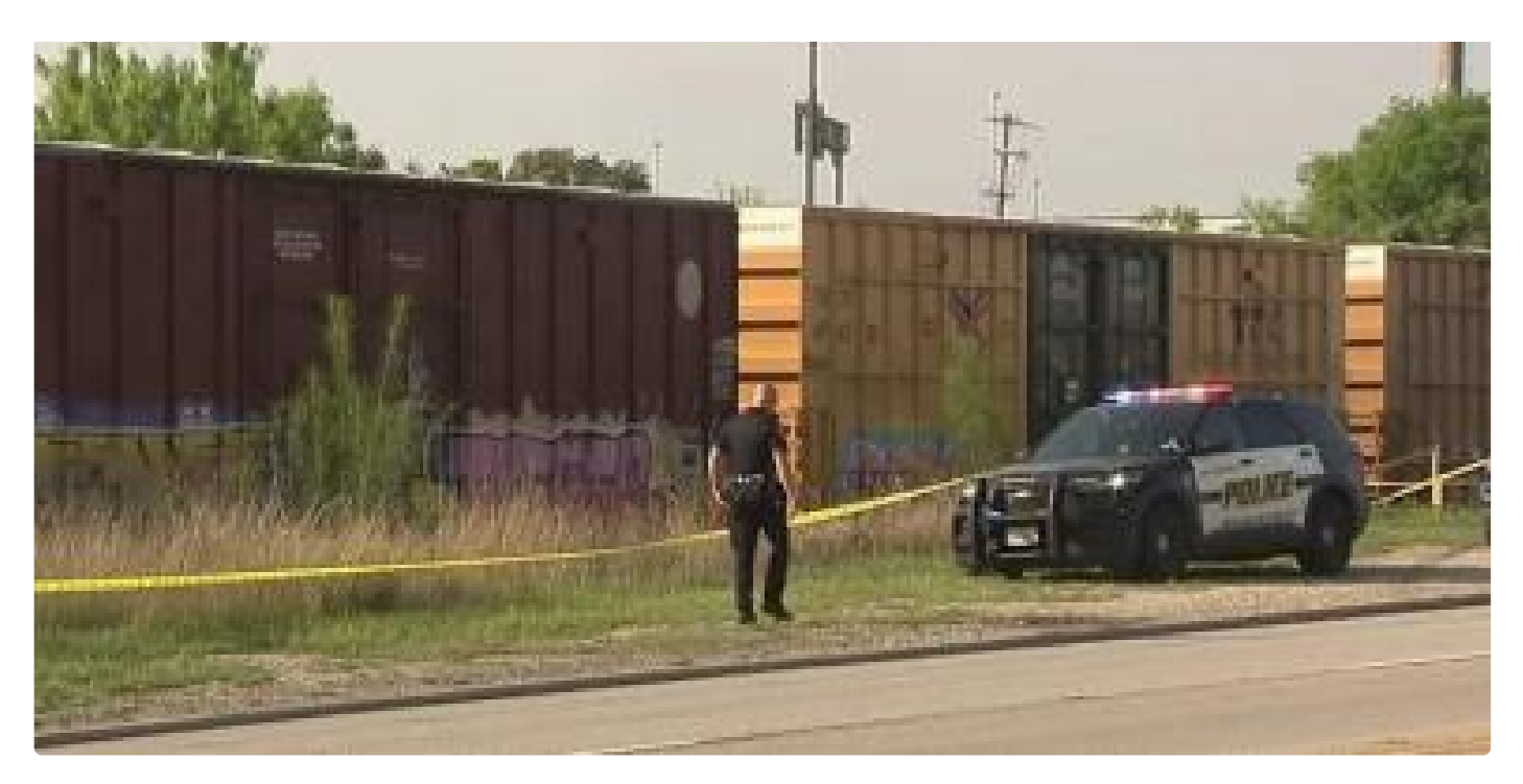
Man dies after being hit by train on North Side