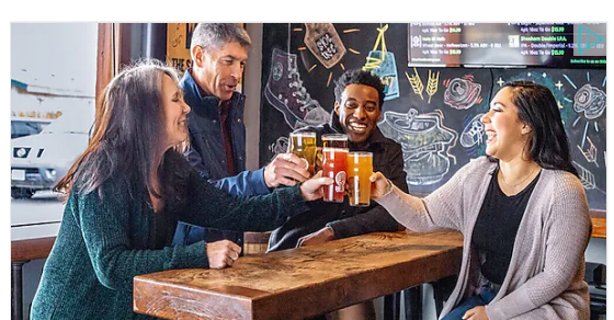
ADVERTISEMENT 10 experiencias sin igual q puedes perder en Nevada