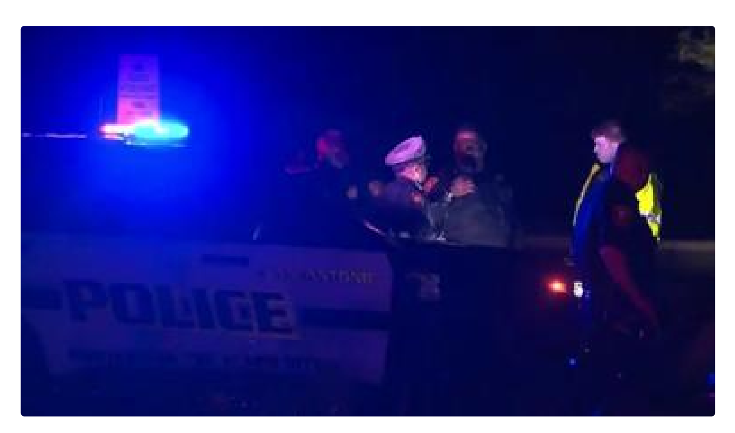
Authorities ID father, son killed in murder-suicide at Hardberger Park