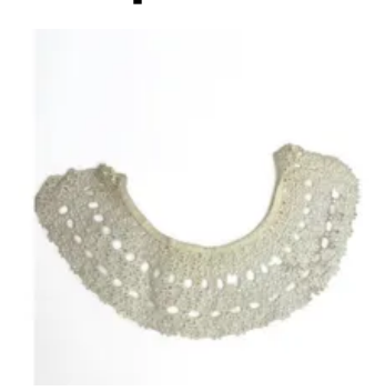
1800s Lace Collar 19th Century Victorian White Floral Patter...