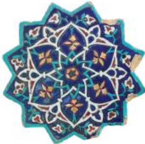
Cultural tile patterns